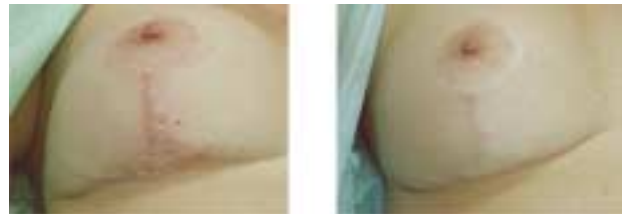
Fig. 4d: Laser LP Nd:YAG 1064nm + AFT 540nm handpieces