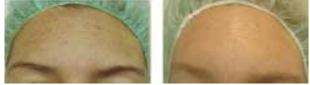
Fig. 4b: AFT 540 + 570nm handpieces

monotherapy, both in safety and efficacy. As the results of these studies become available, a surge in the popularity of combined therapy is expected, with more practitioners offering combination treatments and increased consumer demand for such services.