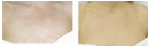
Fig. 4c: AFT 540 + 570nm handpieces