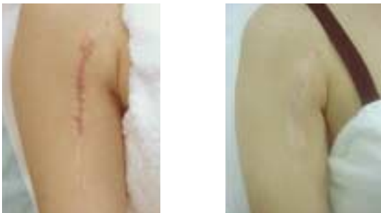
Fig. 4a: Laser LP 1064nm Nd:YAG + AFT 540nm handpieces

Combined therapy and the use of different handpieces in various procedures help refine the quality of the final results. It is important to initially treat (based on the lesion diagnosis, color, depth and location) superficial lesions using the shorter wavelength handpieces, and continue to deeper epidermal-dermal lesions using the near infrared laser. Perhaps the most popular of these procedures today is the combination of nonablative photorejuvenation treatment (pulsed light and laser). Using the full potential of the Harmony, photorejuvenation is not just skin rejuvenation and wrinkle reduction. We compliment the treatment with the removal of unwanted facial hair, acne and soften or eliminate acne scars. Pigmented and vascular lesions and other cosmetic and aesthetic imperfections can now be treated easily and effectively, resulting in higher patient satisfaction. Examples of the various results achieved through combined therapy with the Harmony system are shown in Fig 4a - 4d.