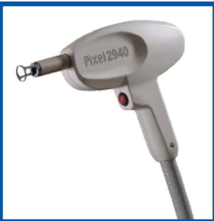
Harmony Pixel 2940 Module

The Pixel 2940 fractional ablative laser represents "the best of both worlds for skin resurfacing," according to Mr. Matzliach. "It combines the proven effectiveness of an ablative resurfacing with the patient comfort level and convenience of a non-ablative approach."