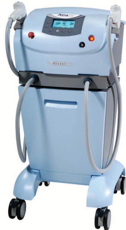
ABOVE: THE ACCENT RF MACHINE

The immediate effect of this heat is to cause the dermal collagen to contract, giving a skin tightening effect. The skin glows and is erythematous for 1–2 hours. There is also a slower progressive effect, where the heat stimulates more collagen production, giving a plumper, more rejuvenated appearance of the skin.